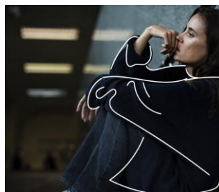
Housing Justice website