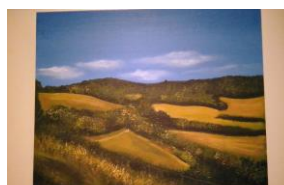
A painting by one of the prisoners – it reminded me of my childhood in Dorset - fields ready for harvesting

Monday 13 th Pray for the group of prisoners whose art work was displayed in St Mary's Church Guildford recently and for the team of supporters who work with them, sharing skills and giving spiritual support.