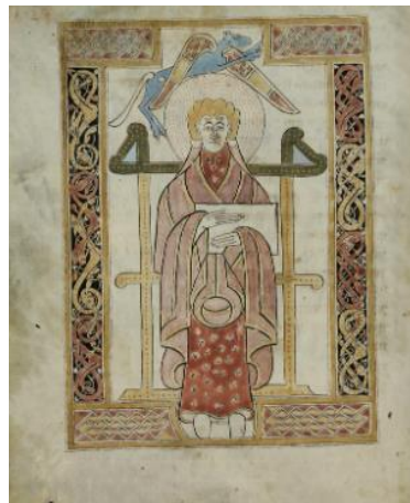
8 th century manuscript painting of St Luke

Saturday 18 th Luke the Evangelist: Give thanks for the writings – Gospel and Acts of the Apostles, and witness of Luke and his role in founding the early Church.