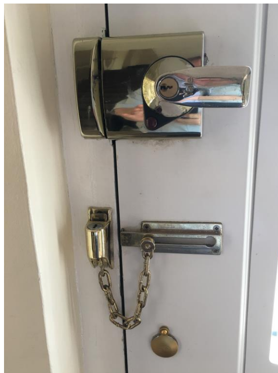
“Locked Doors”

You may like to be still, light a candle, or listen to a calming piece of music as we gather in worship.