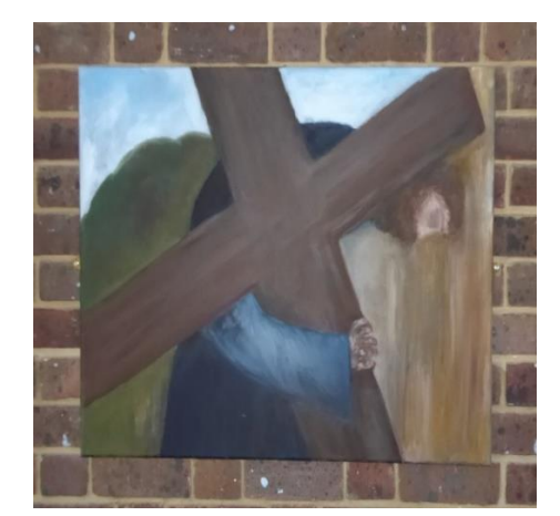
'Christ Carrying the Cross', artist unknown, Bishop Otter College Chapel Chichester