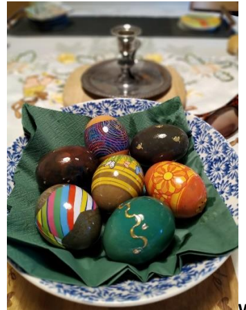
Warr Family Easter Eggs 2022