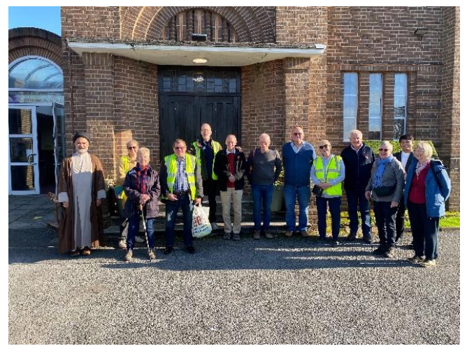
This year's Pilgrims outside Byfleet Methodist Church

We started at Byfleet Methodist Church where there were short talks about the origins of Methodism and the Byfleet church.