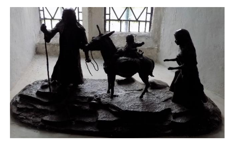
The Flight to Egypt - Breamore Saxon Church, Hampshire