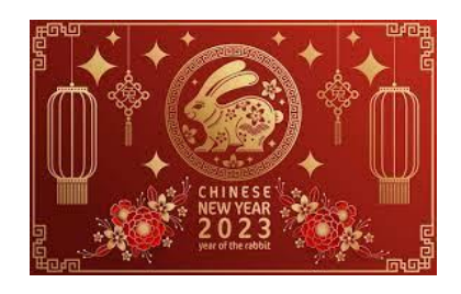
Wish you all a very prosperous Year of the Rabbit 2023.

creator has prepared all living things essential skills for survival. Only that we human beings are too slow, if not too late, to learn the lesson. Rabbit has another role in western culture, Easter bunny. What a cute animal to be related to something so meaningful, resurrection of Christ.