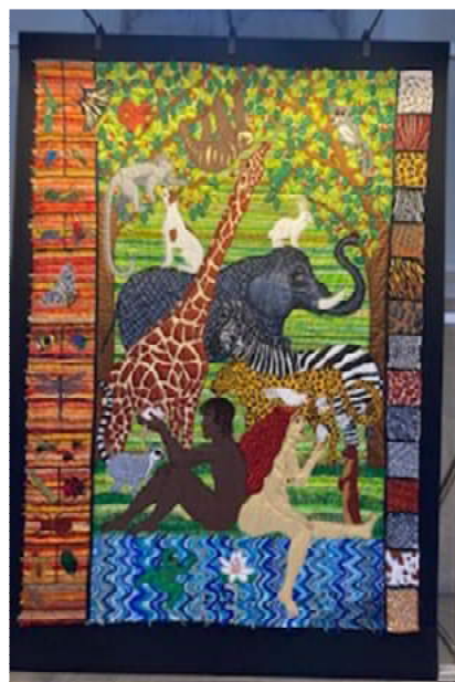
Panel 7 – God created Man & Woman

Caryl and Linda took themselves off to Guildford Cathedral to see the 'Threads through Creation' exhibition. This exhibition comprises 12 huge (at least 10 foot each) textile panels inspired by the first pages of the bible and involving eight million stitches. These photos don't do justice to the magnitude or awesomeness of the panels. We were in awe of the work involved but also of the inspiration which led to this work, which took three years to complete.