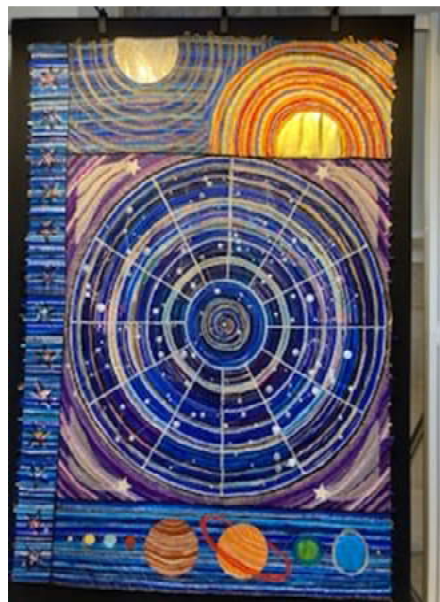
Panel 5 – the Universe