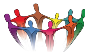
Woking People of Faith

For more information: administrator@wpof.org.uk