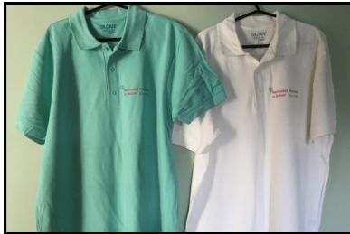
Logo on shirt: