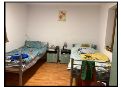
Above: One of the renovated bedrooms, before... and after