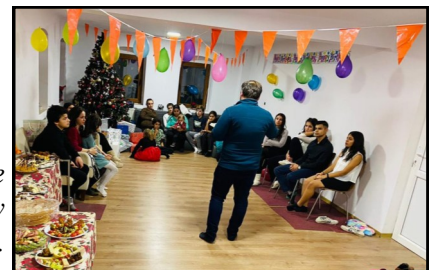
Right: The children celebrate Christmas in their newly renovated common room.