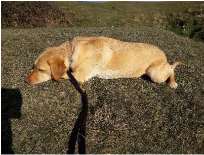
Daisy enjoying a well-deserved rest!

The Plant and Craft sale (see page xx) raised over £750 which is fantastic but the Gold Star must go to Daisy the