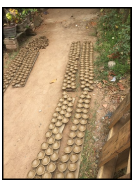
Minuwangodo, Sri Lanka: pots drying in the sun

Another gift of £1,500 went to the Shalom Project for Peace in Kilinochchi, in the northern part of the country. The project provides chickens to women affected by the long civil war, the eggs from which provide not only a source of nutrition for the family but also a means of income by selling in the local market, enabling them to become self-sufficient.