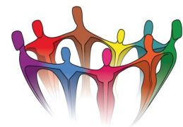
Woking People of Faith

Saturday 24th November, 2.00 pm—4.00 pm, Parkview Community Centre, Blackmore Crescent, Sheerwater, Woking GU21 5NZ.