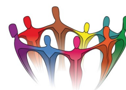
Woking People of Faith

More information E: administrator@wpof.org.uk