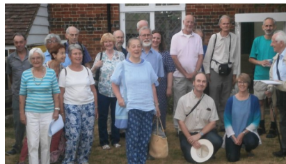
The walkers at the Friends' Meeting House

Around 30 friends joined the Guildford and Godalming Interfaith Forum during the course of the evening on Thursday 19th July. These included friends from the Unitarian, URC, Mormon, Jewish, Guildford and Woking Quakers & Shah Jahan Mosque communities.