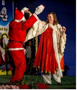
Dancing with Santa!

Just to update you, I arrived back safe and sound last Monday evening in the UK. On Wednesday I went to the visa office and put in my visa application. This time for an Employment visa, honorary worker without salary. They wouldn't let me apply for two years but changed it to one year and said they would send it off to the high commission and said it would take at least a week. To my surprise Saturday morning the doorbell rang and there was my passport being delivered and