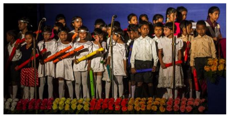
Children playing boomwhackers

Here are a few pictures of some of the events recently: