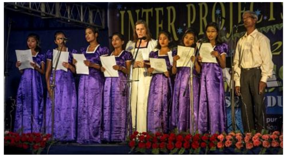
Singing Bengali Prayer song