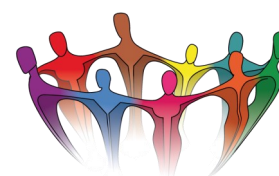
Woking People of Faith

To join on zoom please email: administrator@wpof.org.uk