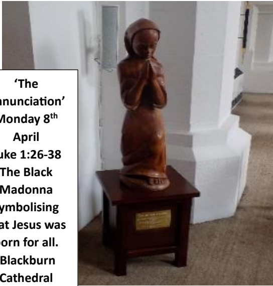
'The Annunciation' Monday 8 th April Luke 1:26-38 The Black Madonna symbolising that Jesus was born for all. Blackburn Cathedral

Bible references are from the NRSVA unless otherwise stated – Hymns are from Singing the Faith - STF, Hymns and Psalms – HP, The Methodist Hymn Book – MHB, other sources are as noted.