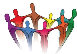
Woking People of Faith

Football tournament: Saturday 30th June at Winston Churchill School.